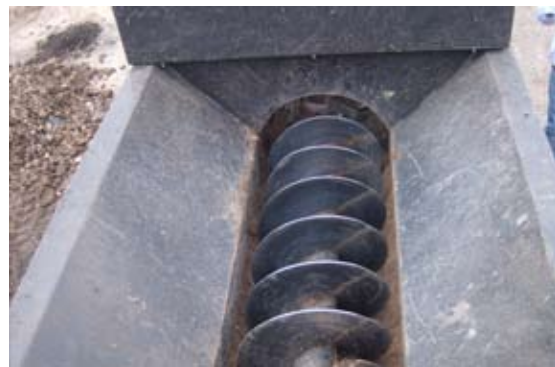
Unique patented hopper feed system, ideal for compost, soils, and woodchip WILLIAM TA114 SCREEN GLISAGE GLISAGE GLISAGE Ideal for contractors, turf contactors, golf clubs and nurseries